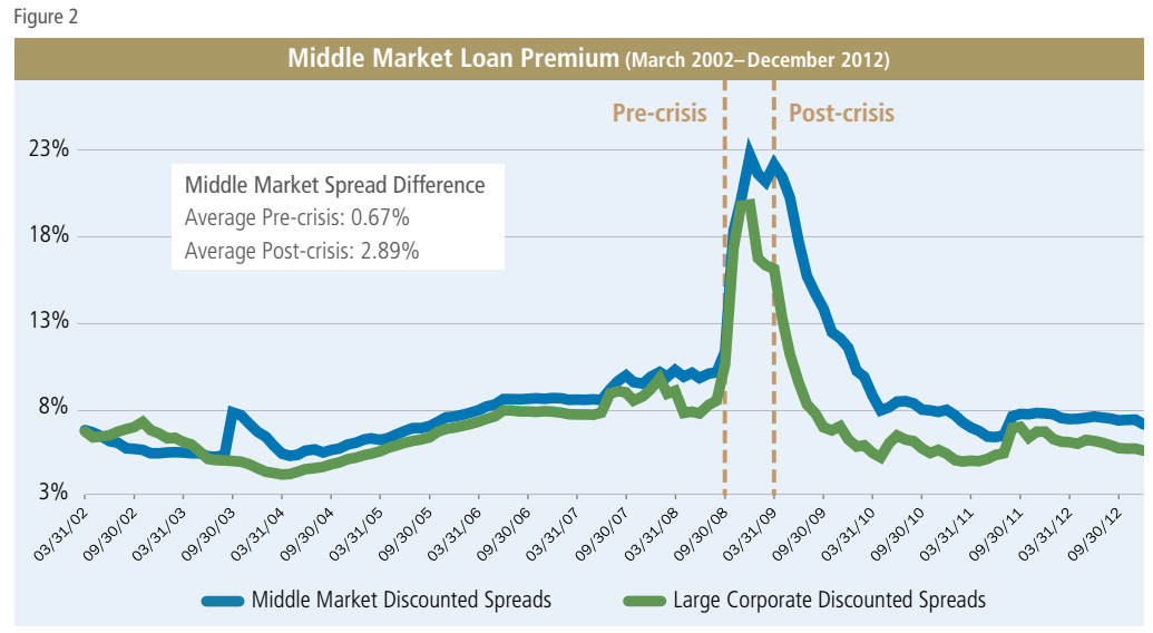
Figure 2 examines the spread differential between syndicated middle market senior secured loans (defined as loans to issuers with less than $50 million in EBITDA2) and syndicated loans to large corporate borrowers (issuers with more than $50 million in EBITDA<sup>3</sup>).

What the data tells us: Prior to the financial crisis in 2008, syndicated loans to middle market borrowers offered higher yields than syndicated loans to large corporate borrowers by an average of